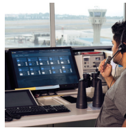
ALCMS CONTROL & MONITORING SYSTEM