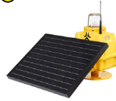
SOLAR HOLDING POINT LIGHT