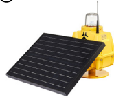
SOLAR RUNWAY EDGE LIGHT