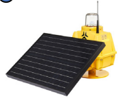
SOLAR TAXIWAY EDGE LIGHT