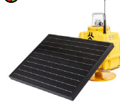
SOLAR RUNWAY THRESHOLD END LIGHT